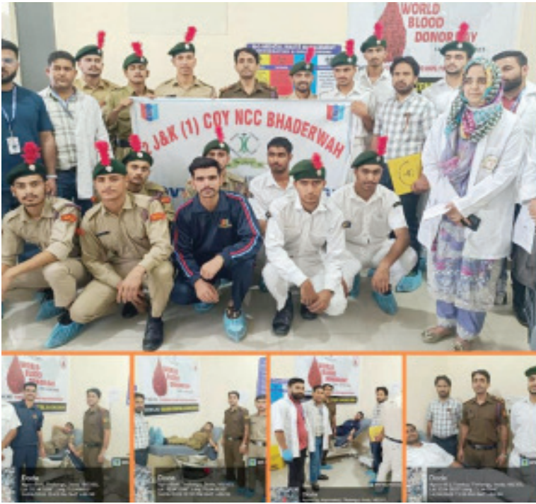
hygienic procedures during the entire process.