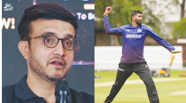
horses like Siraj, Arshdeep. Not sure about

portz about how to use Bumrah in the England Test series, Sourav Ganguly said, “You’ve got to look out for him and not make him bowl more than 12-13 overs a day. Use him as a wicket-taker, and that’s the key. That’s how Gill should use him. I believe four fast bowlers are important. Here, others will have to be the war-