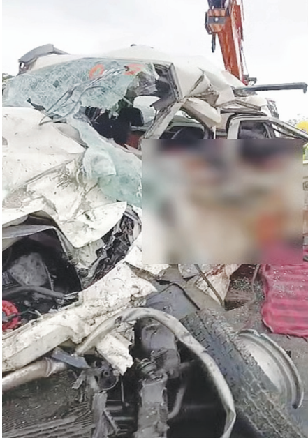
VIJAYAPURA, May 21 (Agencies): In a tragic road accident that occurred early Wednesday morning near Managuli village, a Mahindra XUV300 travelling towards Solapur jumped the median and collided head-on with a VRL bus coming from Mumbai and heading to Ballari.