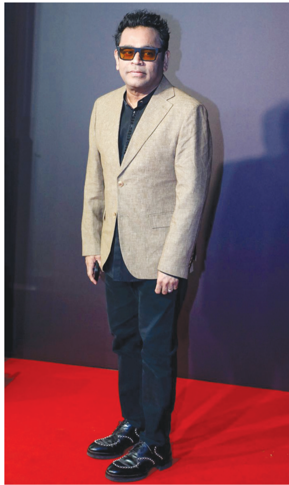
app. The 58-year-old musician has a slew of projects in the pipeline, including the romantic

The global premiere of 'The Wonderment Tour' is said to be a grand concert under the aegis of the WAVES summit taking place from May 1 to 4. Tickets are now available on Zomato