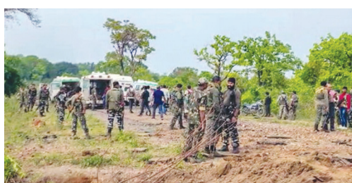
domination operation, an official said. Six other Naxalites were arrested from forts

Seven lower rung cadres were apprehended on Tuesday near Tekmetla village under Usoor police station area, when a joint team of the CoBRA (Commando Battalion for Resolute Action- an elite unit of CRPF) and local police was out on an area