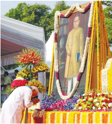
Born in a Dalit family in 1891, he was a brilliant student who went on to study in foreign countries. The discrimination he suffered in Indian society turned him into a committed social reformer. He was India's first law minister. He died in 1956.

NEW DELHI, Apr 14 (Agencies): Paying tributes to Bhim Rao Ambedkar on his birth anniversary, Prime Minister Narendra Modi said on Monday that it is due to his inspiration that the country is today dedicated to realising the dream of social justice. His principles and ideas will strengthen and speed up the building of an 'aatmanirbhar' (self-reliant) and developed India, Modi said on X. Later, Modi joined a number of other dignitaries, including President Droupadi Murmu, Vice President Jagdeep Dhankhar, Lok Sabha Speaker Om Birla and leaders of opposition in both Houses Rahul Gandhi and Mallikarjun Kharge, among others, in Parliament to pay homage to Ambedkar. Ambedkar is recognised for his lifelong struggle for the empowerment of Scheduled Castes and his key role in drafting the Constitution.