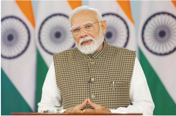
said. Good health, he added, is the foundation of every thriving society.

"On World Health Day, let us reaffirm our commitment to building a healthier world," he