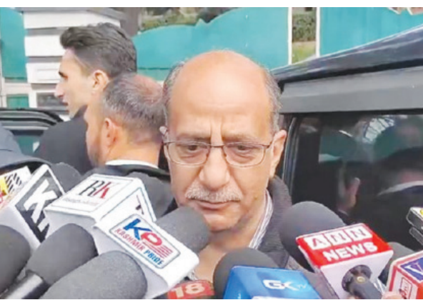
SRINAGAR, Apr 5 : A day after Jammu and Kashmir

that the elected government is well aware of its boundaries. "We also know our