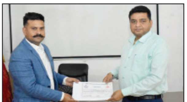
Top News Report

Three-day course on "Developing Effective Communication Skills, Responsibility towards General Public" concludes at SKPA