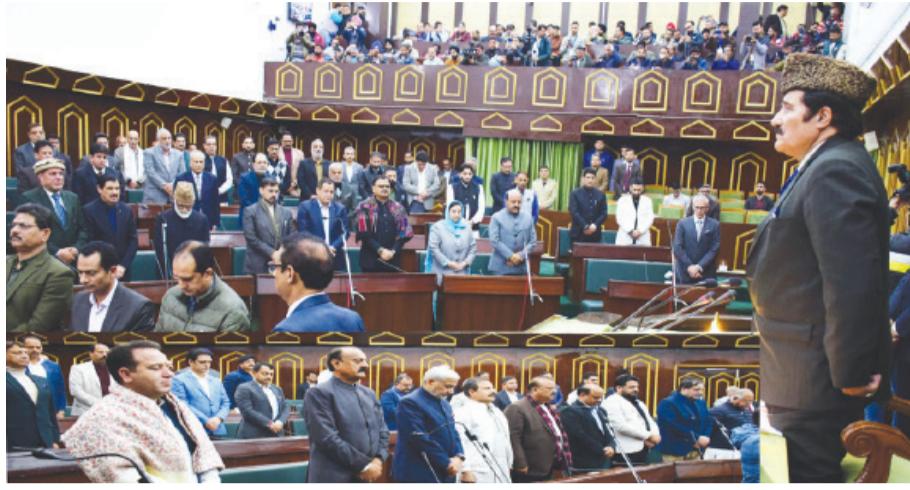
Nation will be remembered forever.

During the Obituary references, the Speaker remembered the contribution of former Prime Minister, Dr. Manmohan Singh in shaping the economy of the country. He remembered him as a statesman, whose contribution to this