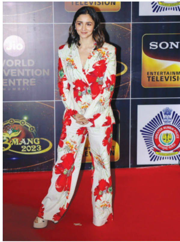
latest vlog, Bhatt ventured into her mother

Meanwhile, the 'Udta Punjab' actress recently dropped a heartfelt video of her attempt to cook her favorite dish for the first time. In her