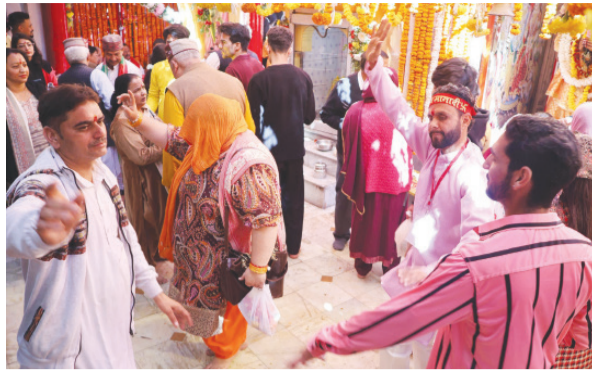
which continued from 1:00 PM to 8:00 PM. The soulful rendition of bhajans and hymns dedicated to Goddess Chandi created an atmosphere of divine bliss, leaving the devotees deeply immersed in devotion. The melodious chanting and rhythmic beats of traditional instruments uplifted the spiritual energy of the gathering. The event was graced by the presence of several prominent personalities and VIPs, who paid their respects to the deity and extended their best wishes to the devotees. The presence of respected community members and religious

from 12:00 Noon to 4:00 PM at Brahmin Sabha, Parade, Jammu. Hundreds of devotees partook in the Bhandara, embracing the spirit of unity and devotion. The temple management ensured a well-organized and disciplined arrangement for the feast, making it a fulfilling experience for all attendees. The highlight of the celebration was the Kirtan (devotional singing),