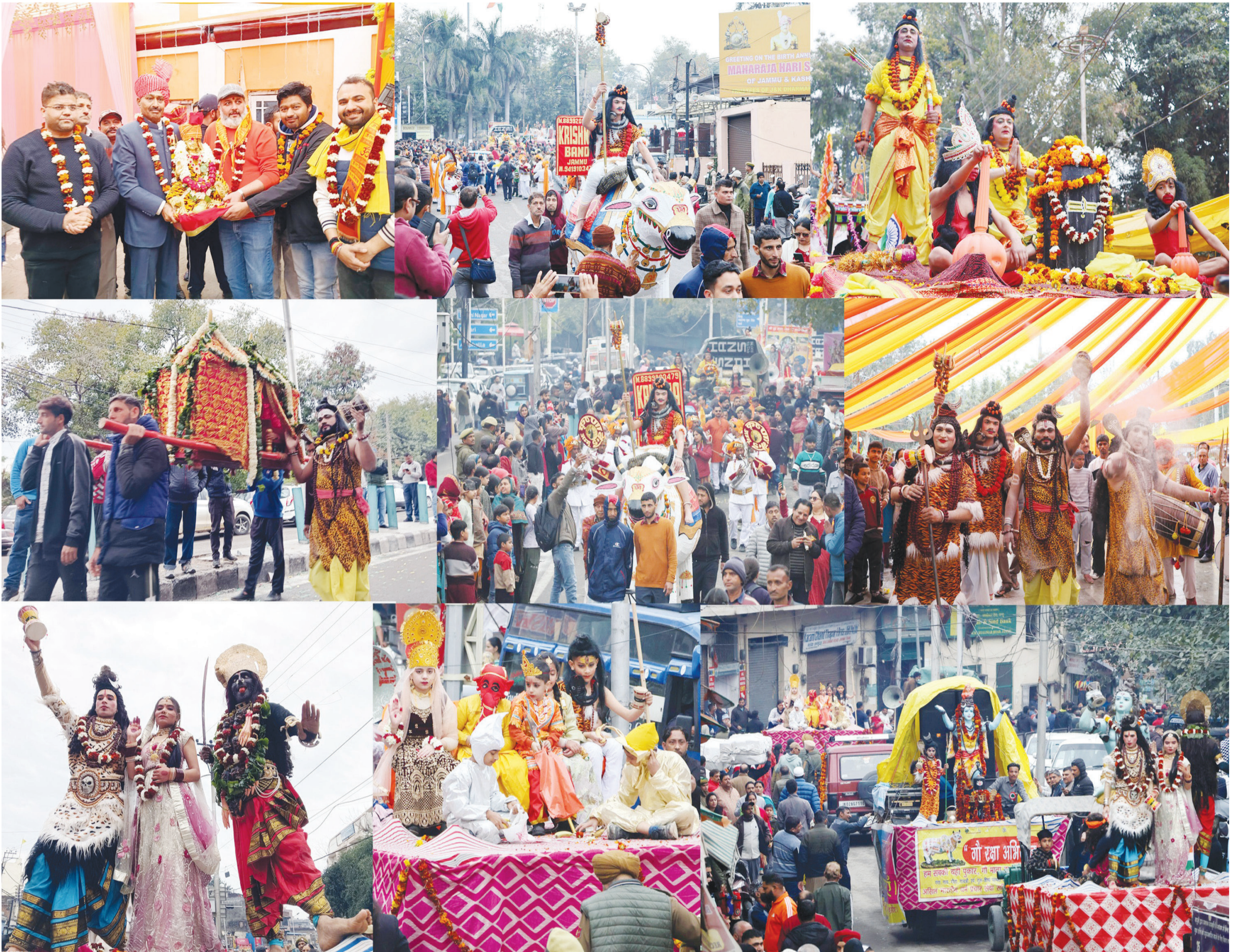
Chanting Har Har Mahadev and Om Namah Shivaya, devotees taking out impressive Shiv Barat procession ahead of Maha Shivratri in Jammu.