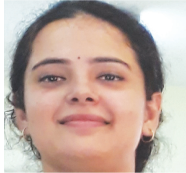
Case of Select Countries". Her research has been pub-