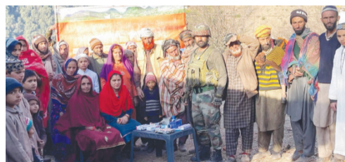
Indian Army demonstrates its dedication to the welfare of the people and its role as a force for good.

By providing medical aid and support, the