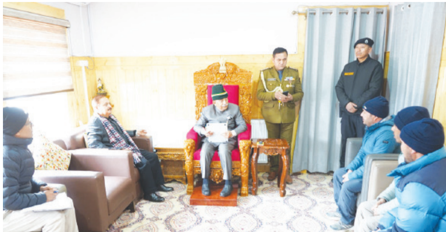
District were present during the meeting. The delegation apprised the LG that