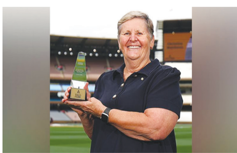
Member of the Melbourne Cricket Club and a life member of the Marylebone Cricket Club.