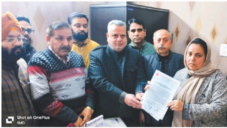
Government order no. 457HME of 2023 dated June 2, 2023, which created the post of Technical Officer Pharmacy in GMC Jammu, the association demanded the creation of similar posts in all District and Sub-District Hospitals to ensure fair treatment of pharmacists in the health department.

Many pharmacist positions remain unfilled across various institu-