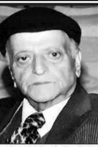
Sh. Om Prakash Badal