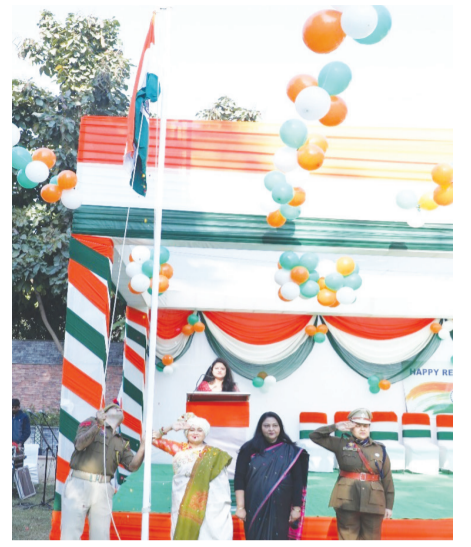
Resident Commission. Later, Principal Resident Commissioner interacted with the officers and officials of J&K House.

A colourful cultural programme was presented on the occasion besides release of coffee table book and calendar of the