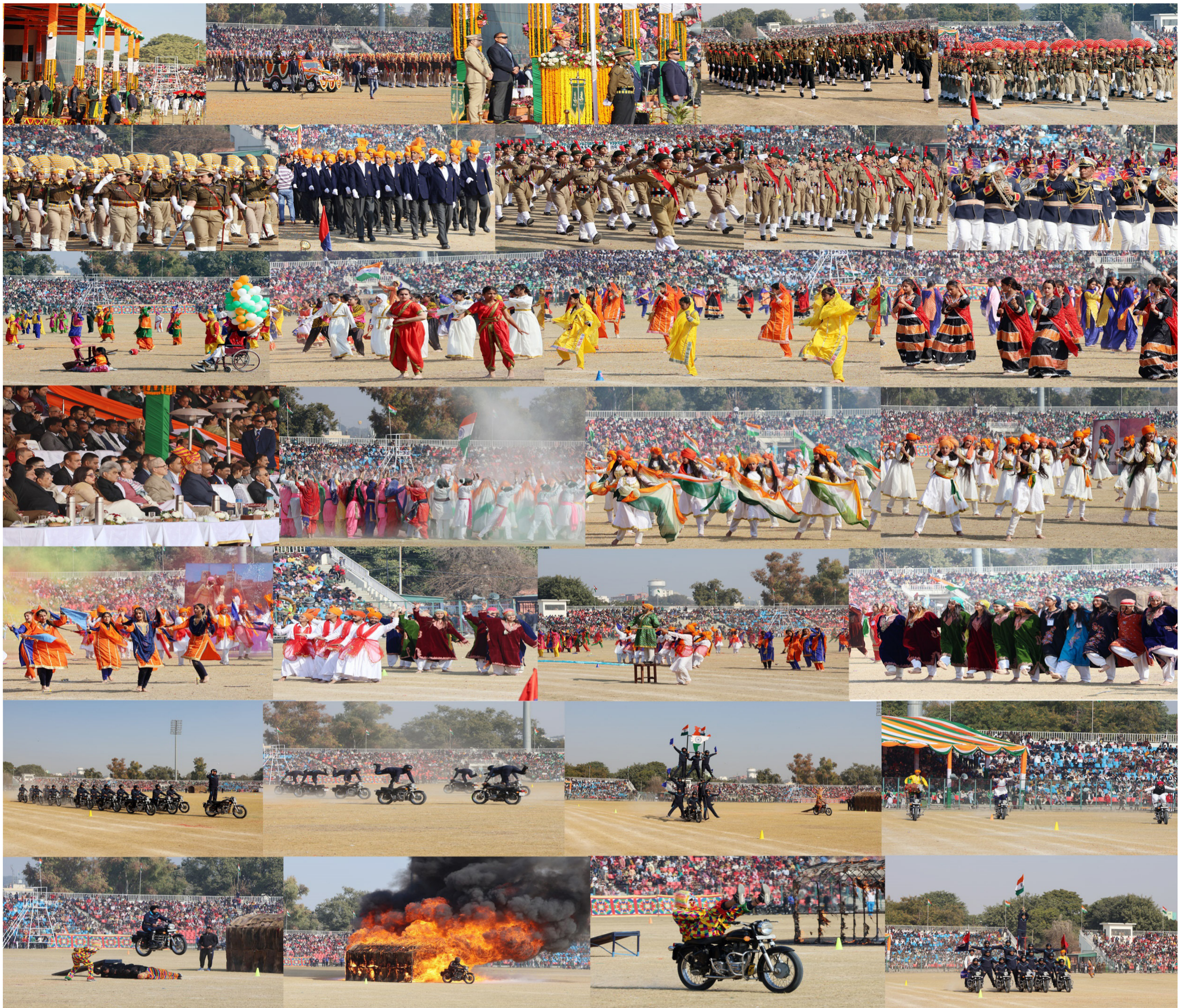
Array of cultural performances, parades, and displays of unity mark impressive Republic Day celebrations at MA Stadium in Jammu.