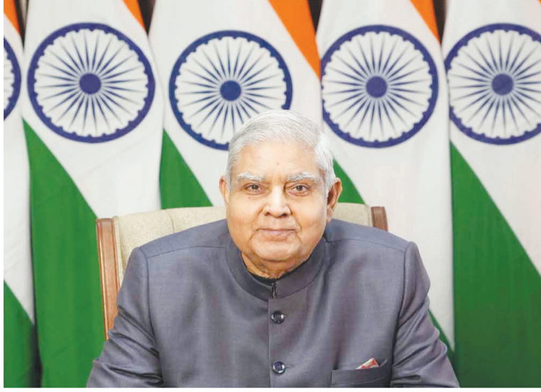
and mindset," he said. He asserted that the philosophical schools of Vedanta, Jainism, Buddhism and others

"We have to unshackle ourselves from colonial legacy