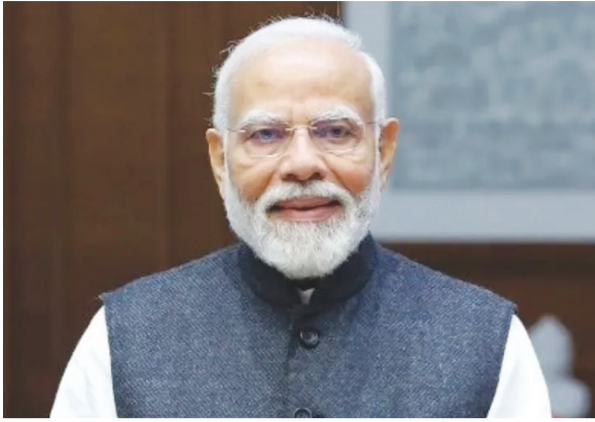
NEW DELHI, Jan 14 (Agencies): Prime Minister Narendra Modi greeted people on the