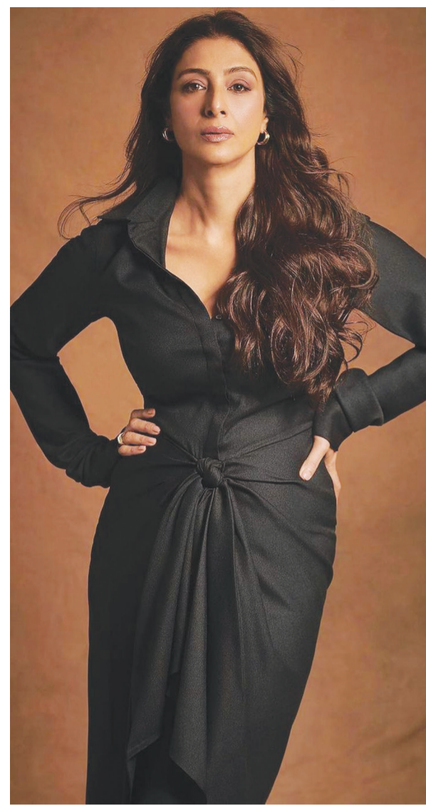
Superstar Tabu has boarded the cast of Priyadarshan's upcoming horror comedy "Bhooth