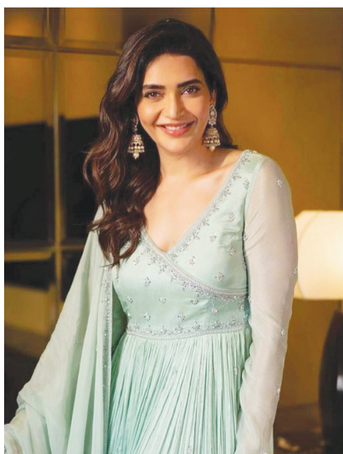
loved the energy it brought to the day," recalls the actor, saying, "I have fond memories of

Kite flying, a quintessential Sankranti activity, evokes fond childhood memories for the 41-year-old. "I was never great at it, but I