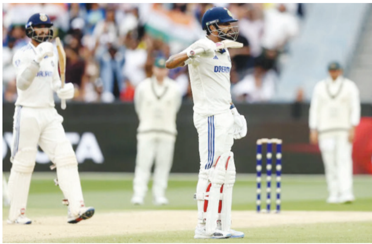
Reddy's batting was based on a stable core, playing the ball late and only going for the drive when the ball was pitched up. He wasn't defending unnecessarily and 10 fours and a six was a testimony to that.