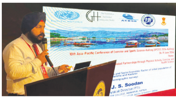
Conference APCESS 2024- Kaifeng.