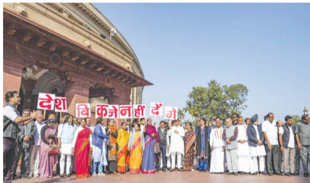
demonstrations led by the Congress over the Adani issue. Congress general sec-

This is the latest in a series of unusual daily