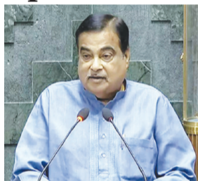
people do not fear the law and many drive two-wheelers without helmets and some jump

NEW DELHI, Dec 12 (Agencies): As many as 1.78 lakh people are killed in road accidents annually in the country and 60 per cent of the victims are in the age group of 18-34 years, Road Transport and Highways Minister Nitin Gadkari informed the Lok Sabha on Thursday. He lamented that