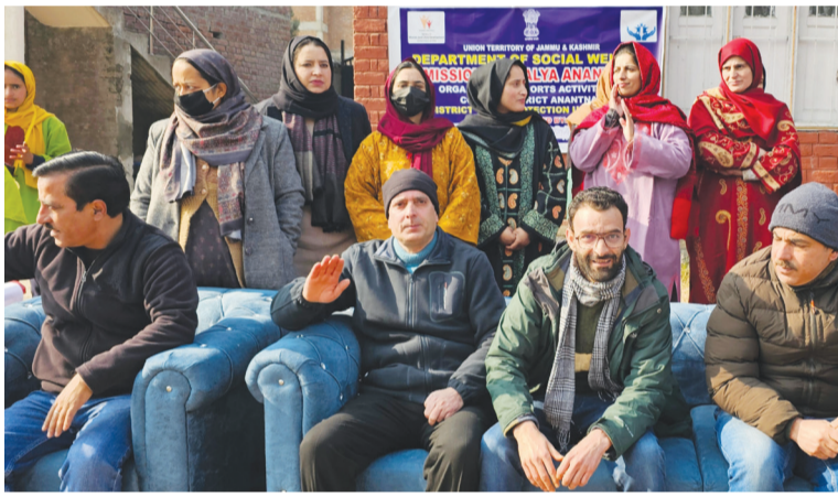
chess and carrom, showcasing their skills, sportsmanship and teamwork. The event served as a plat-

The children participated enthusiastically outdoor games including cricket, Kabadi, Kho Kho and Tug of War & in indoor games children participated