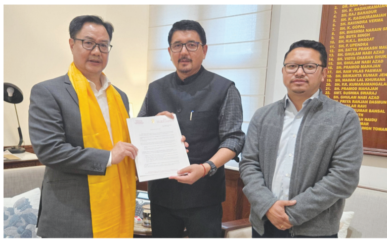
This move will surely be seen as a significant step towards promoting Ladakh's rich Buddhist heritage and strengthening its

During the meeting, the CEC submitted a memorandum to the Minister, requesting his support in bringing the Holy Relics of Lord Buddha to Ladakh during the upcoming summer months.