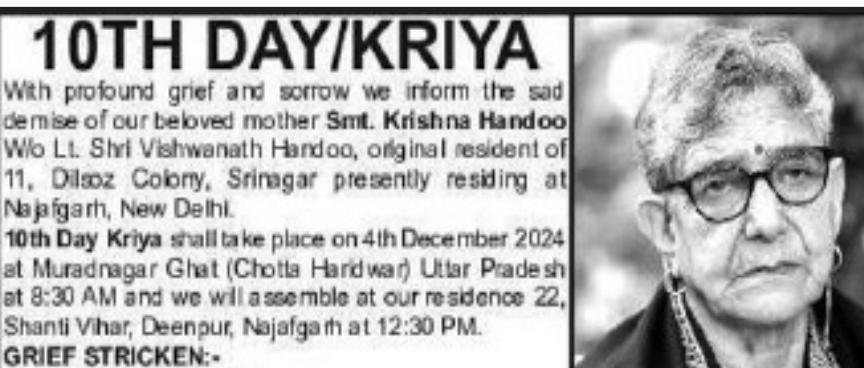
SMT. KRISHNA HANDOO

CONTACT NO: 9906264961, 7006656008, 9796212142, 7006403112