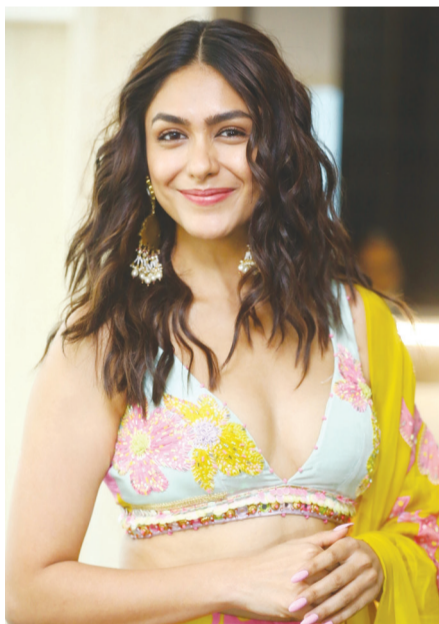
designs in films and it was my dream to be dressed in such designer outfits."

The actor, currently filming for Son of Sardaar 2, adds, "We all grew up watching (designer) Manish Malhotra's