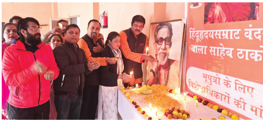
of Hindutva. Balasaheb was in favor of 'one country, one constitution and