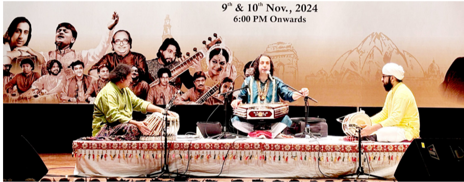
9 th & 10 th Nov., 2024 6:00 PM Onwards

The Wasul disappeared from the music scene largely due to Sufiana musicians adopting the Dukka and later Tabla due to many social reasons, coupled with the tragic loss of the Sopori family's own age-old Wasul during the Kabali Raid in Kashmir in October 1947.