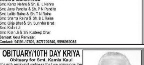
OBITUARY/10TH DAY KRIYA

"Top News of J&K" does not take responsibility for the contents of the advertisements (Display/ Classified) carried in this newspaper. The paper does not endorse the same. Readers are requested to verify