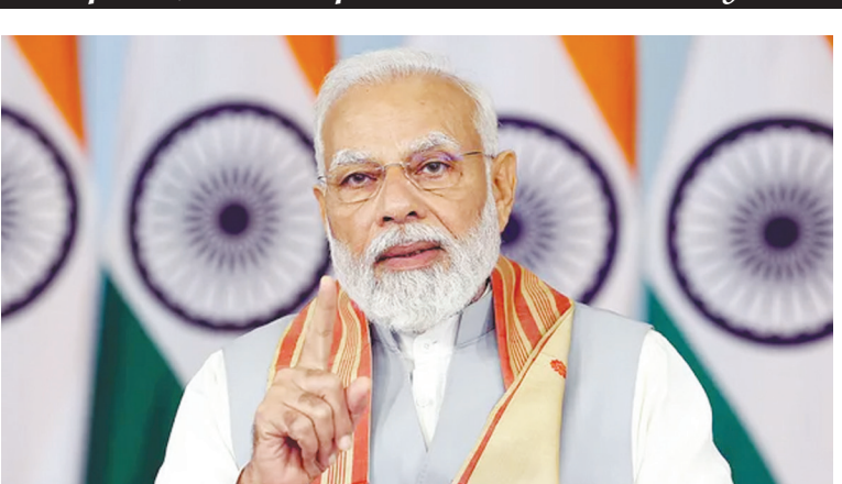
that over the decade, lakhs of pensioners and pensioner families have benefitted from this landmark initiative. Beyond the

numbers, OROP represents the government's commitment to the well-being of our armed forces," he said.