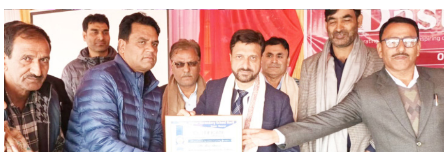
Top News Report

KUPWARA, Nov 7: Additional Deputy Commissioner, (ADC), Handwara, on Thursday attended the Annual Day function at Grils Higher Secondary School (GHSS) Haril.