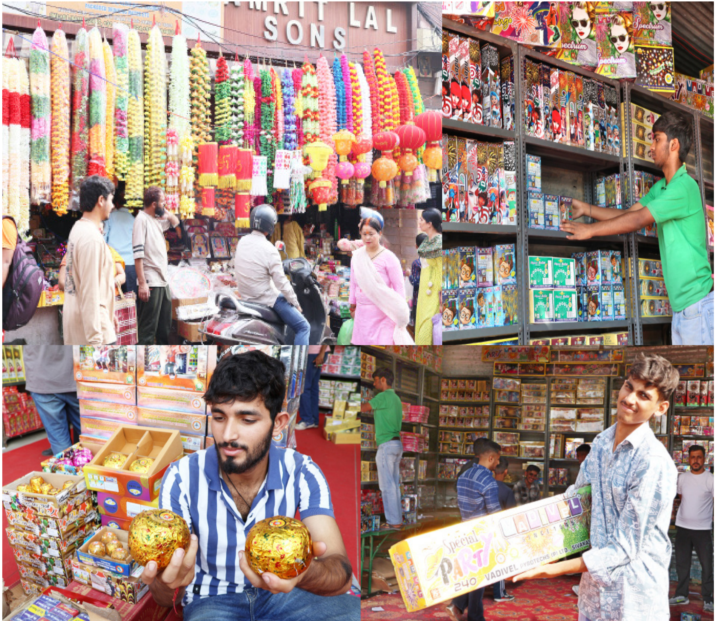
Crackers and decorative material stalls set up across Jammu on Diwali celebration.