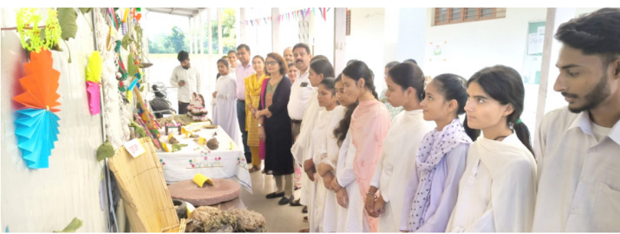
Top News Report

MARHEEN, Oct 14: GDC Marheen Marheen promotes Dogra Culture by celebrating five days long activities on the theme of "Panjh Din, Panjh Rangh, Dogra Sanskriti Sangh". The event was organized and supervised by the Department of Dogri in collaboration with IQAC and Cultural Committee. Opening ceremony of the whole event was inaugurated with the college decoration and by displaying different items related with Dogra Virasat such as Platry, Shiku, Dharat, Rongli Datan, Behni, Chhajj, Bhari,