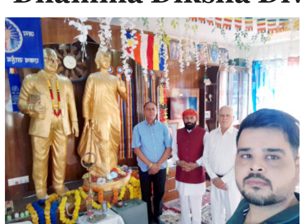
Top News Report