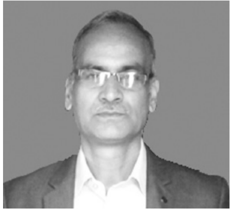
By: Omkar Dattatray

Finally the impatient wait of the political parties and the gullible people has come to close with the final count of votes in Jammu and Kashmir and declaration of the results of the assembly polls which were crucial and historical in more than one way. The outcome of the polls has more or less been as predicted by the exit poll and opinion poll and at the end of the political churning a fractured mandate has come to fore and this churning has produced the political nectar in the form of win to NC-Congress and thus the din and dust of election has given rise to the full chance of NC-Congress coalition government in the mountainous region Jammu and Kashmir which is rightly called the crown of India. Despite the claims and counter claims of NC-Congress pre poll alliance and the BJP of forming the coalition government in the UT, at the end of the counting, it is NC-Congress alliance towards which the balance of power is tilted and it is this pre-poll alliance of NC-Congress which is now in a comfortable position to form a coalition government in Jammu and Kashmir after a long wait and spell of governors rule. The BJP and its leaders both UT's and national were over-confident of forming government in Jammu and Kashmir. But