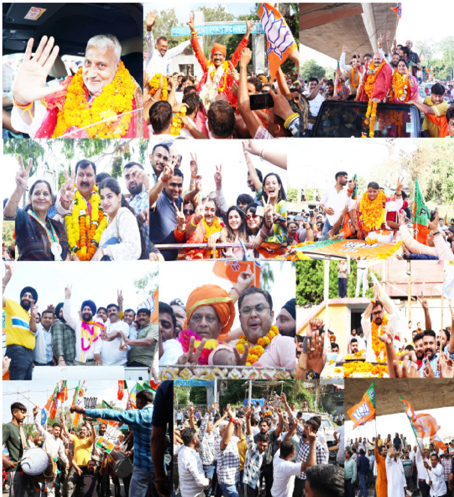
BJP and other candidates with supporters celebrating their victory in Jammu and Kashmir Assembly Election 2024 in Jammu on Tuesday.