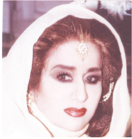
By: Shahnaz Husain

The J&K assembly election results signify a crucial juncture in the region's political trajectory. As the newly elected representatives prepare to assume their roles, the onus is on them to foster a climate of peace, development, and inclusivity. The elections have not only reshaped the political landscape but also reignited hopes for a more responsive and accountable governance structure in Jammu and Kashmir. The coming months will be critical in determining how these dynamics unfold and whether the aspirations of the electorate are met.