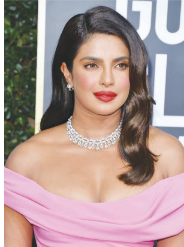
Actress Priyanka Chopra Jonas, who is busy with the shoot of the second season of her upcoming streaming series 'Citadel', has

shared a leaf from her routine that she follows these days.