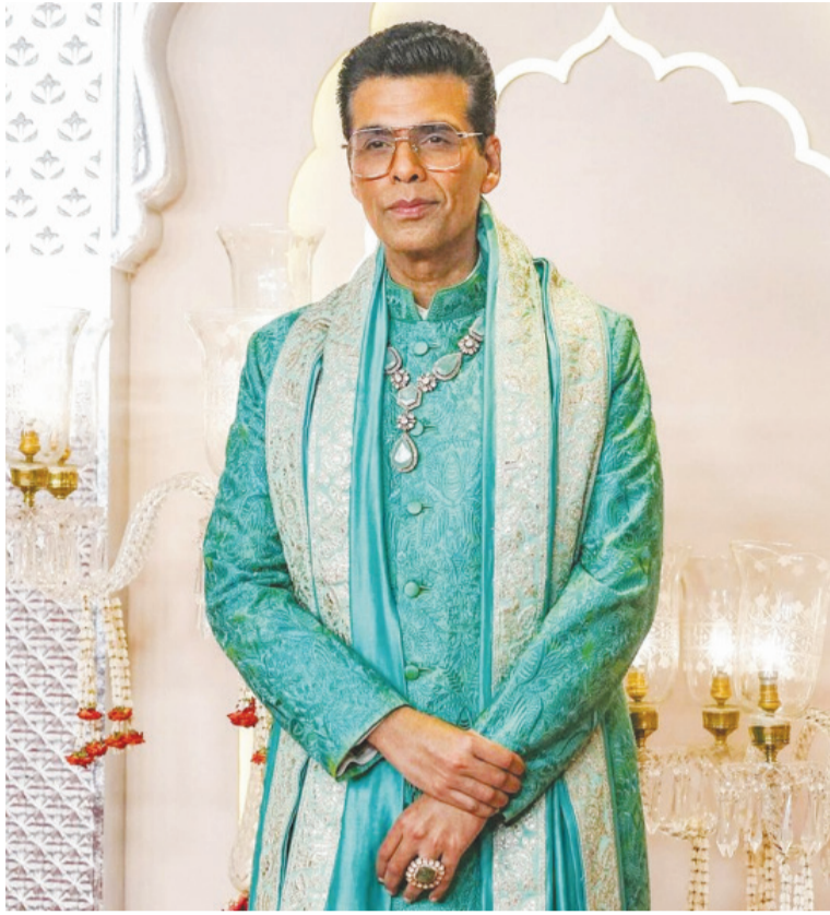
(sic) Johar wrote.

"I broke up with the nauseous noise and muted the unwarranted angst... but social media is like the Lockness monster it's gets to you even when you can't see it... so was flooded with Vasan Bala's interview which he answered with pure innocence and so much love... the gore misinterpretation of his comment about me sending the script to Alia without his grammar checks made me laugh initially at the ludicrousness of it all but now is truly annoying me