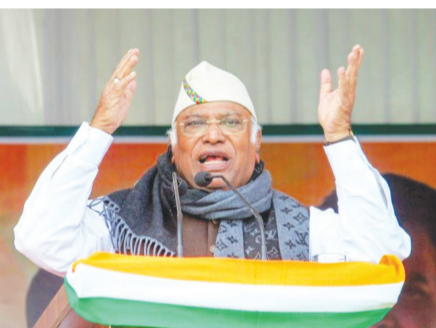
BENGALURU, Oct 7 (Agencies): All India Congress President Mallikarjun

Kharge on Monday expressed confidence about his party coming to power in Haryana, and the party along with its alliance partner National Conference forming the Government in Jammu and Kashmir.