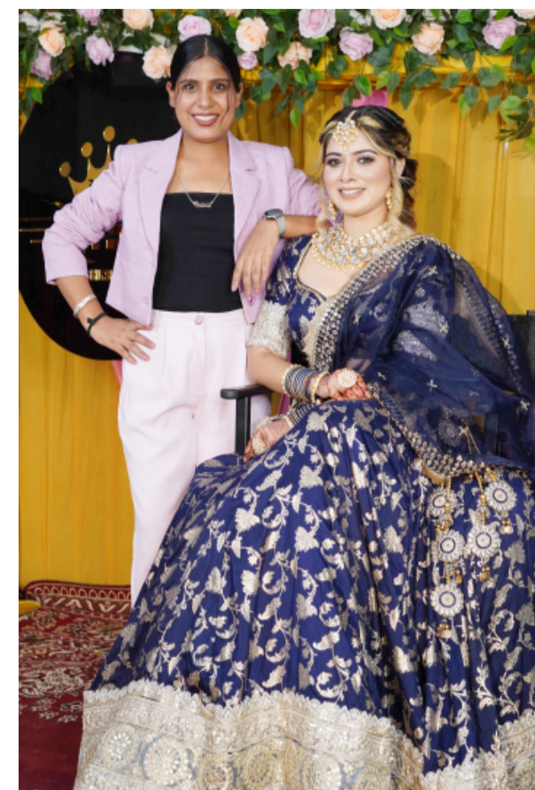
Working with Diverse Skin Types and Complexions. Masterclass Bridal look created by Celeb-

Mastering Flawless Base Makeup, Long-Lasting Bridal Looks for Different Occasions, Latest Trends in Eye Makeup and Lip Artistry.