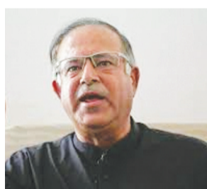
Lieutenant Governor (LG) in the nomination

SRINAGAR, Oct 7 (Agencies): A day before Jammu & Kashmir Assembly election results, J&K Congress Chief Tariq Hameed Karra expressed cautious optimism about the outcome while raising concerns about exit polls and the role of the