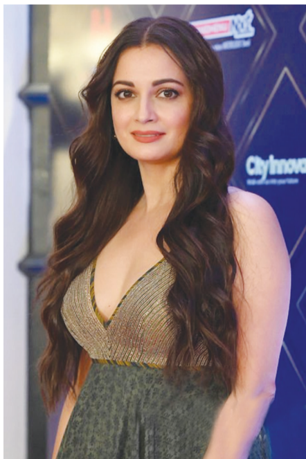
Fight Club – Members Only, Alag, Lage Raho Munnabhai, Honeymoon Travels Pvt. Ltd., Sanju, Thappad and Bheed.