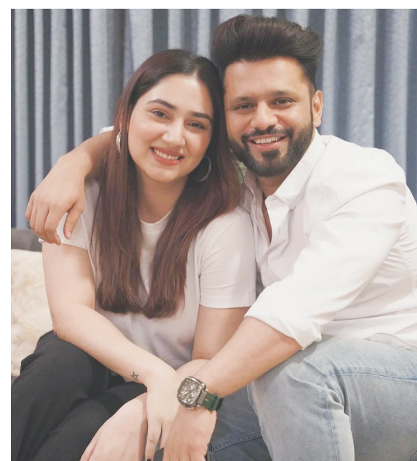
Actor Disha Parmar has revealed that she has entered the 'sick club', after her hus-

band and singer Rahul Vaidya has got infected with dengue.