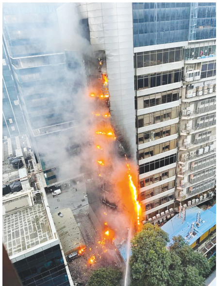
Parkside residents said it was a "terrifying experience" to see plumes of flame and smoke rising close to their homes.

The Kamala Mills compound, which has witnessed many major fires, is located next to the Parkside residential building.