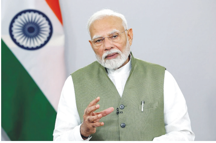
latest technology to conserve water," said the PM.

"For water conservation, we have to work on the mantra of 'reduce, reuse, recharge and recycle'. We also need to adopt innovative techniques and the