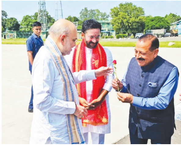
national general secretary Tarun Chugh and senior party leaders of Jammu and Kashmir. He will be meeting with the BJP leadership here to discuss poll preparations.

JAMMU, Sep 6 (Agencies): Union Home Minister Amit Shah will launch the BJP's poll campaign and release the party's manifesto here during his two-day visit to Jammu and Kashmir beginning Friday. The Union minister's arrival in Jammu comes at a critical time for the BJP in the Union territory as the party faces growing challenges ahead of the assembly elections, with several leaders and workers protesting after being denied tickets. A few protesting leaders have also quit the party. Shah was received at the airport by Union ministers G Kishan Reddy and Jitendra Singh, BJP