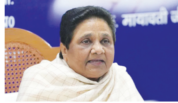
LUCKNOW, Aug 27 (Agencies): Mayawati was unanimously re-elected as the national

Mayawati is a 4-time former chief minister of Uttar Pradesh. BSP founder Kanshi Ram had declared her as his political successor over 2 decades ago.