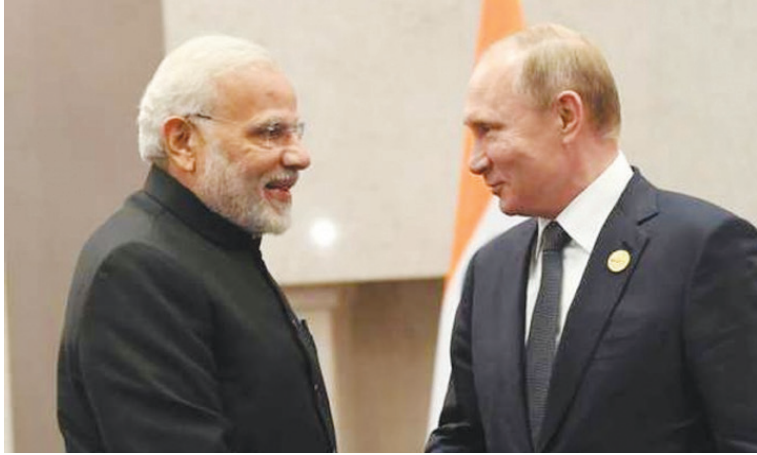
firm commitment to support an "early, abiding and peaceful

PM Modi, who has not yet condemned the Russian invasion of Ukraine, also reiterated India's