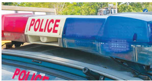
The abuse began in May, and on Monday,

The accused befriended the girl and started visiting her family frequently. When the girl's parents were away for work, he came to her house and allegedly forced her to enter into a physical relationship with him by promising to marry her, he said.