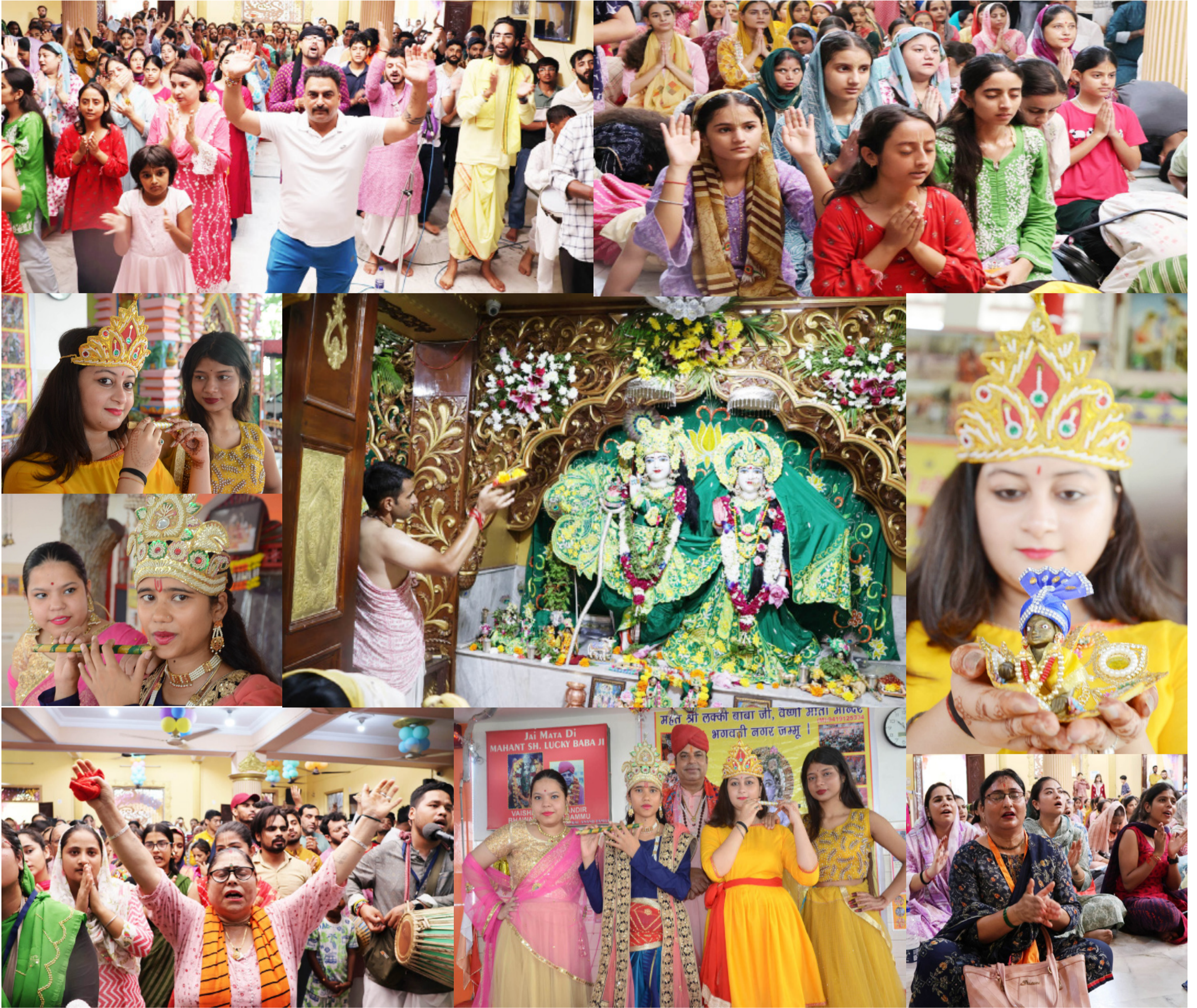
Devotees thronged ISKCON and other temples across Jammu to celebrate the auspicious occasion of Shri Krishna Janmashtami with great fervour and devotion on Monday.