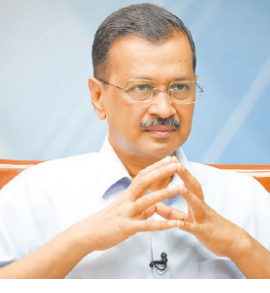
days' time to Kejriwal to file a rejoinder.

NEW DELHI, Aug 23 (Agencies): The Supreme Court on Friday deferred till September 5 hearing on Delhi Chief Minister Arvind Kejriwal's pleas seeking bail and challenging the arrest by the CBI in the alleged excise policy scam. A bench of justices Surya Kant and Ujjal Bhuyan allowed the CBI to file its counter affidavit in the matter and gave two