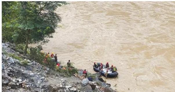
drove off the highway in Aaina Pahara in Tanahun district.

The bus from Gorakhpur was heading towards the capital Kathmandu from the resort town of Pokhara when it