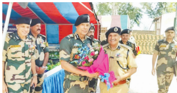
security measures by top officials. This is the first visit of

He also interacted with troops on the ground and was briefed about