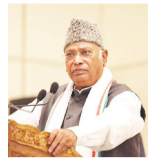
leaders and workers here to get feedback about the grassroots-level preparations for the assembly polls. "This was the first

SRINAGAR, Aug 22 (Agencies): Congress chief Mallikarjun Kharge on Thursday expressed willingness to forge an alliance with other opposition parties for the upcoming Jammu and Kashmir assembly polls and termed BJP's promises to the people of the Union Territory "jumlas". Kharge along with Leader of Opposition in Lok Sabha Rahul Gandhi on Thursday spoke with Congress