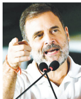
SRINAGAR, Aug 22 (Agencies): Leader of Opposition in the Lok

Sabha Rahul Gandhi on Thursday said it is the priority of the Congress party and the INDIA Bloc to restore statehood to Jammu and Kashmir.