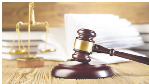
additional fees upon re-registration. Striking down the imposition of 9% token

JAMMU, Aug 22 (Agencies): High Court of Jammu & Kashmir and Ladakh has quashed 9% tax demand on outside J&K vehicles and clarified that once a motor vehicle is registered upon payment of the prescribed fee under the Central Motor Vehicles Act, 1988, such registration is valid throughout India, and there is no provision for re-registration or the imposition of