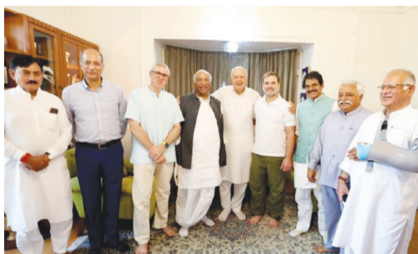
SRINAGAR, Aug 22 (Agencies): Hours after

the Leader of Opposition in the Lok Sabha, Rahul