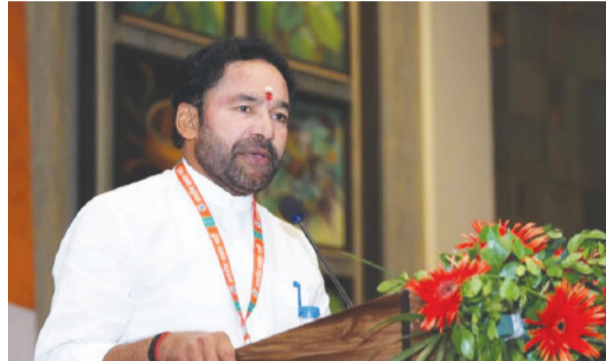
370 and the National Conference's resolution. "Sonia Gandhi and Rahul Gandhi should tell

JAMMU, Aug 22 (Agencies): Union Minister G Kishan Reddy criticized Congress leader Rahul Gandhi's visit to Jammu and Kashmir on Thursday, attributing Gandhi's ability to dine at Lal Chowk in Srinagar to the achievements of Prime Minister Narendra Modi-led government over the past decade. He also asked Rahul Gandhi to clarify Congress' stand on Article