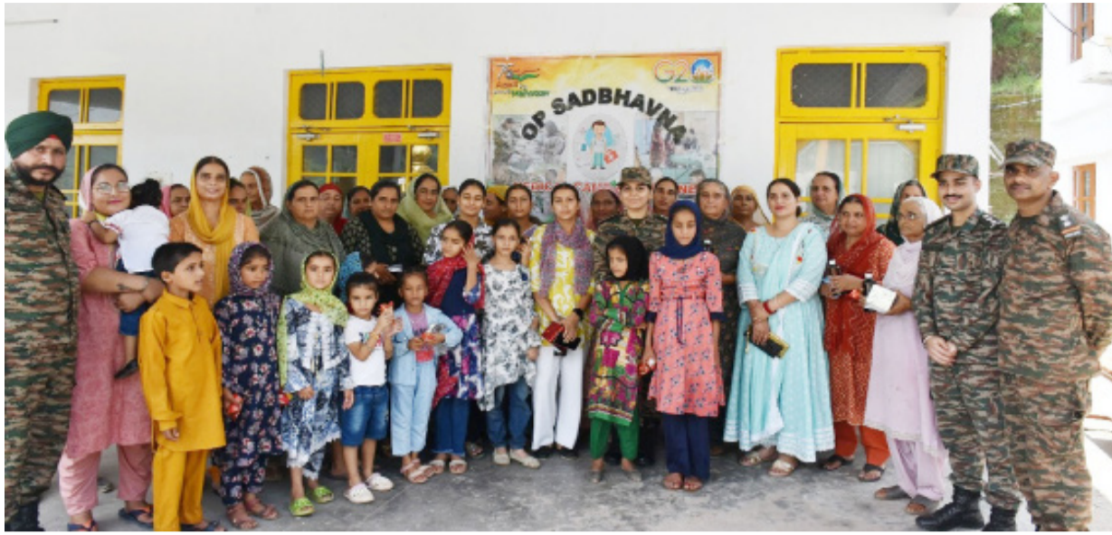
Assistant from Advanced Dressing Station (ADS), Naushera helped in the smooth conduct of event.

NAUSHERA, Aug 19: On Rakshabandhan Medical screening and health awareness campaign was organised as part of Operation Sadhbavana and AWWA activity at Baba Banda Singh Bahadur Gurudwara by Indian Army on 19 Aug 2024. The aim of the medical camp & health lecture was to create awareness of general health among the people. Provide general health care services and counsel them on basic health and hygiene. A total of 30 civil (women) participated and were felicitated. Medical team comprising of Doctor and Nursing