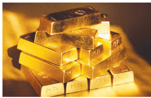
Directorate of Revenue Intelligence authorities by the BSF, they said.

The jawan did not fire more bullet rounds as farmers were working nearby. The seized gold will be handed over to the Customs and