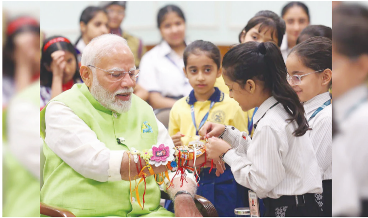
Raksha Bandhan with my young friends," he wrote. "Here are glimpses from a