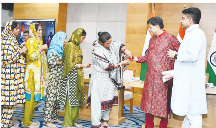
Hindus, Sikhs, Jains, Buddhists, Parsis and Christians.

"The Citizenship (Amendment) Act has provided respect and safety that is your right," he said, adding "this is one of the best