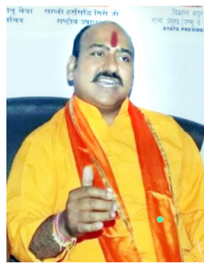
with the enemies," he said.

"Let us tell you that amid the ongoing operation in Jammu and Kashmir against terrorism, Farooq Abdullah spewed venom against the army and said that the country's army is in cahoots