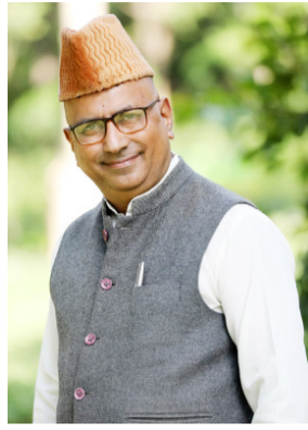
Health Care," he stated. "The program specifically targets individuals over 30 years of age, screening them for common

Khatana pointed out that the NP-NCD program represents a population-based initiative aimed at the prevention, control, and screening of common non-communicable diseases (NCDs), including three prevalent cancers. "This initiative has been rolled out across the country under the NHM as part of Comprehensive Primary