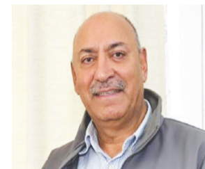
that the they are aligned with BJP. We have seen it in the elections that they

"I have parted ways with the Apni Party as friends. But, it was clear