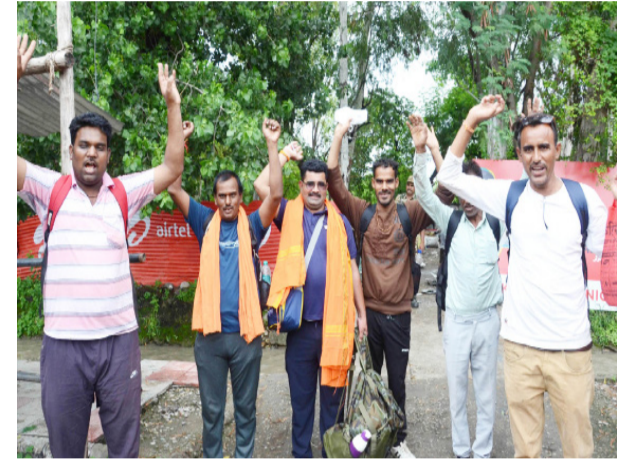
at the cave shrine. The 52-day long Amarnath Yatra will conclude on August 19.

Last year, over 4.5 lakh pilgrims paid obeisance