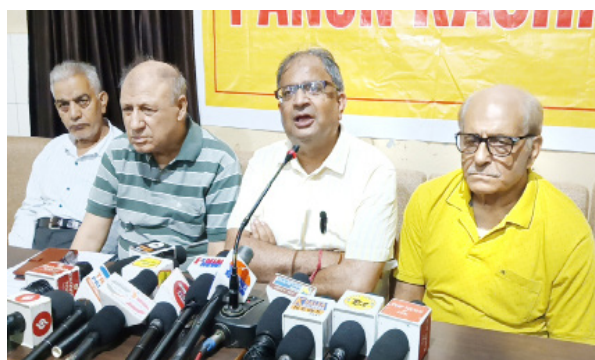
merely as migration. This denial, according to Panun Kashmir leaders, provides tacit support to terrorist groups and sends a dangerous message that the GoI is willing to overlook severe crimes against humanity committed against Hindus in Jammu and Kashmir. The organization criticized the GoI's employment policy for displaced Hindus from Kashmir, describing it as a façade that forces these individuals into a communal order, thereby presenting a false image of secularism. Panun Kashmir leaders argued that this policy turns these employees into captives, used to maintain an illusion of normalcy and shield the government from taking necessary actions. They also pointed out the BJP government's failure to visit Hindu victims of terrorism in Jammu and Kashmir.

JAMMU, Aug 1: Panun Kashmir has urged the Government of India (GoI) to reevaluate its political and strategic approaches regarding the separatist and terrorist activities in Jammu and Kashmir. They stressed the need for the GoI to abandon any strategies that inadvertently support terrorism and separatism in the region. Addressing a press conference here on Thursday, Panun Kashmir leaders highlighted that while Pakistan's involvement in internal subversion is evident, certain policies and perspectives of the GoI also create an environment conducive to such subversion. One significant criticism is the GoI's denial of the genocide against Hindus in Kashmir, referring to it