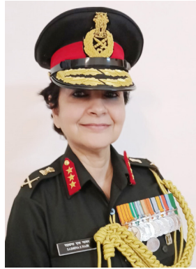
she went to schools at Tezpur, Gorakhpur, Kanpur and Chandigarh. She graduated from the Armed Forces Medical College, Pune with a distinguished academic record and was commissioned into the Army Medical Corps in Dec