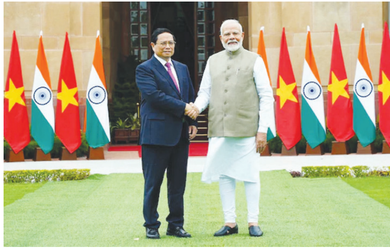
nam Comprehensive Strategic Partnership on the agenda," he said ahead of the talks.

"Substantive discussions to further energise the India-Viet-