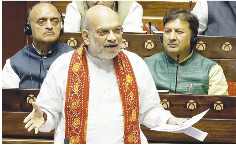
Shah speaking at the Rajya Sabha.

Shah assured the House that the Narendra Modi government was standing a like a "rock" with the Kerala government and people of the state in this moment of the tragedy. He also promised all help from the cen-