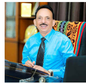
Indian Institute of Finance.