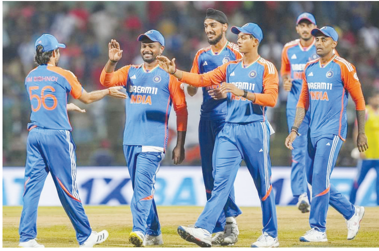
matches in Sri Lanka.

The 2023 edition, hosted by Pakistan Cricket Board, was held in 'Hybrid Model' as India refused to travel to the neighbouring country and played its