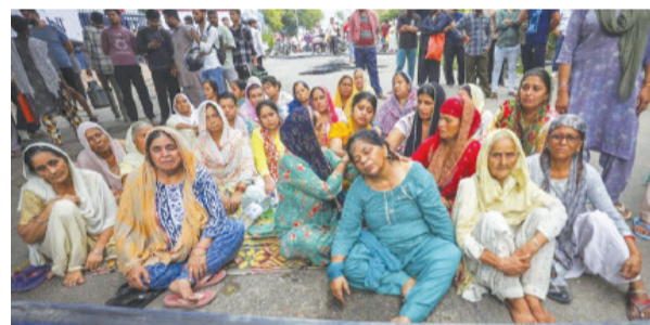
locality on the outskirts of