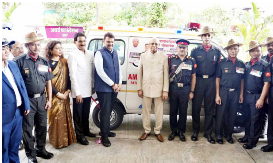
Sainik Boards of Manipur, Assam, Sikkim, Nagaland and Arunachal Pradesh in the past years.

Atharva Foundation has also donated ambulances to the Rajiya