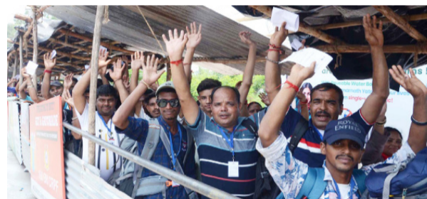
group included 2,734

The 20th batch of pilgrims left at 3:05 am in 127 vehicles under CRPF escort from Bhagwati Nagar base camp. The