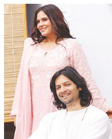
Actor Richa Chadha on Tuesday dropped some captivating images from her maternity shoot with her husband Ali Fazal.

In the photos, Richa and Ali are seen embracing the baby bump.