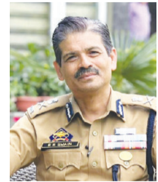
Swain made these remarks during an exclusive interview with CNN-News18 while discussing the current security

"Every single policeman of J&K Police will fight shoulder to shoulder and avenge; we will make sure the enemies pay a heavy price," Swain stated.