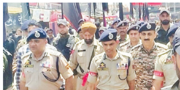
politicians, the ADGP,