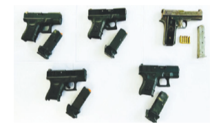
recovered from them, a major achievement in disrupting trans-border drug smuggling networks. "Investigations revealed the Pakistan link", Punjab

Five pistols and an equal number of cartridges, besides magazines, were