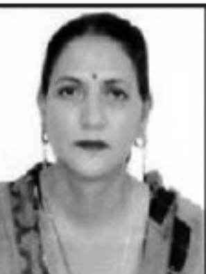
SMT ANJALI MISRI