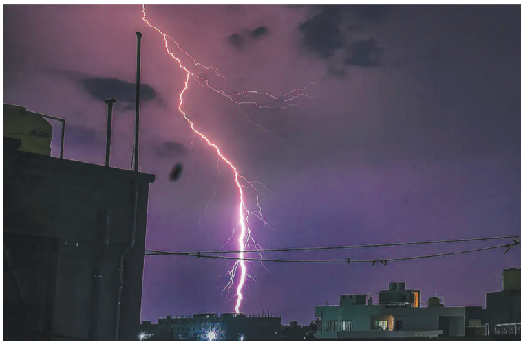
lightning strikes in July alone. However, the unofficial figure may be more than that.

According to the Bihar State Disaster Management Authority, 50 people have died due to