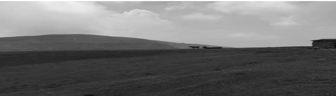
VIEW OF LADHA DHAR

A children's park also needs to be developed in the vicinity of the shrine. As the climatic conditions of this region are much similar to those of the Kashmir valley. All this can help a lot in boosting tourism and attracting tourists, especially from Jammu and neighbouring states to this beautiful region.