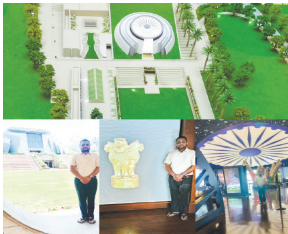
Minister Museum, whose ticket is Rs.50 .

Reception hall and getting ticket : After reaching the reception hall we proceed to the ticket counter after meeting the security criteria, the ticket rate is Rs.50 per person, on Saturday and Sunday it is Rs.100, Selfie with Prime Minister here. Walk with Prime Minister, time machine, air travel, autograph, travel ticket etc can be availed, full of artificial technology, can also get hearing aid guide to visit Prime